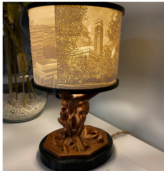
Radiology fellow Fadi Azer, MD, created this 3D-printed lamp, which was displayed in the Vanderbilt Radiology Art Gallery.

And sometimes people use art for shorter means of communication. Drawing anatomy about different procedures, for instance, is sometimes more helpful to patients because they can see what it looks like, and it can be easier for them to understand what's going to be done. Even sketching out a diagnosis is more helpful than just a verbal description. I think sometimes we forget this.