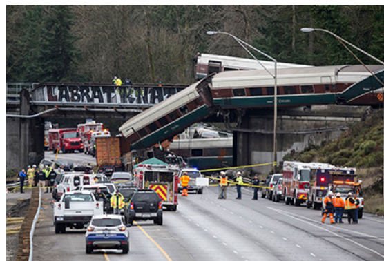
When an Amtrak train derailed near Tacoma, Washington, in December of 2017, Madigan Army Medical Center received many of the more than 70 people who were injured in the crash.